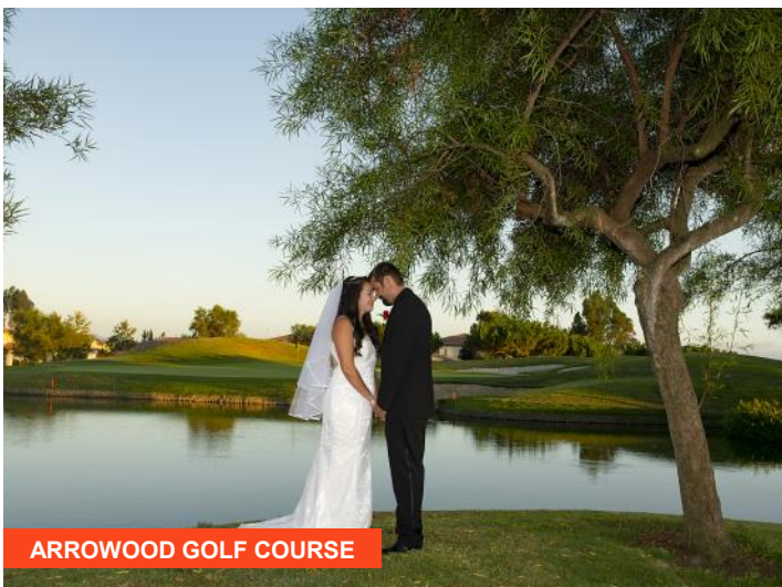
ARROWOOD GOLF COURSE

236 S Coast Highway info@localtaphouse.com Private: 50-175