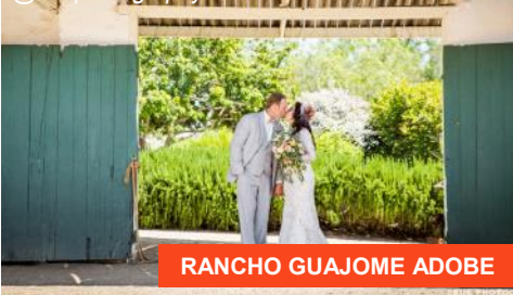
RANCHO GUAJOME ADOBE