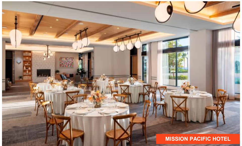
MISSION PACIFIC HOTEL

vacasa.com/usa/California/Oceanside Multiple Oceanside locations available (800) 544-0300