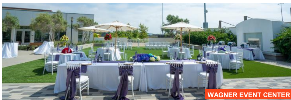
WAGNER EVENT CENTER