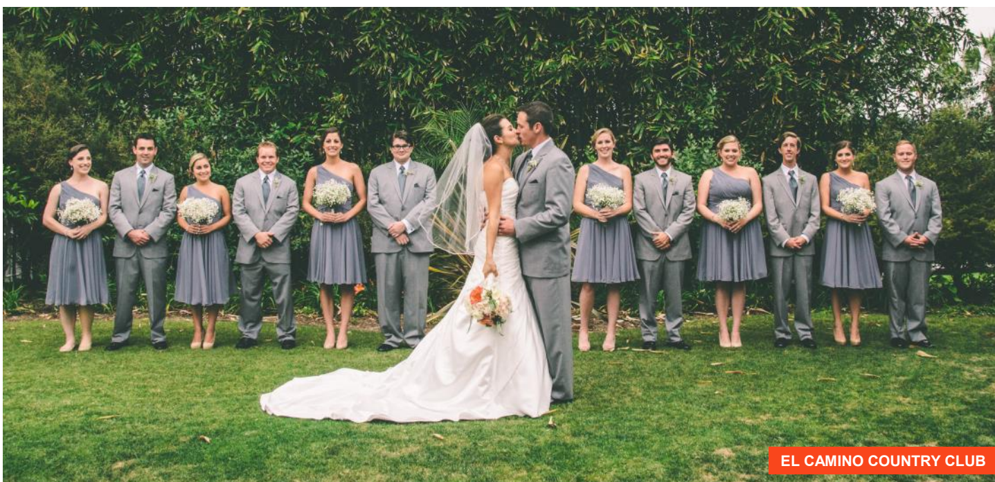
EL CAMINO COUNTRY CLUB