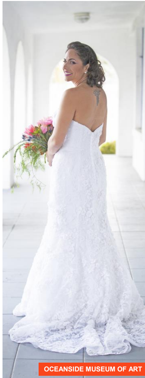
OCEANSIDE MUSEUM OF ART