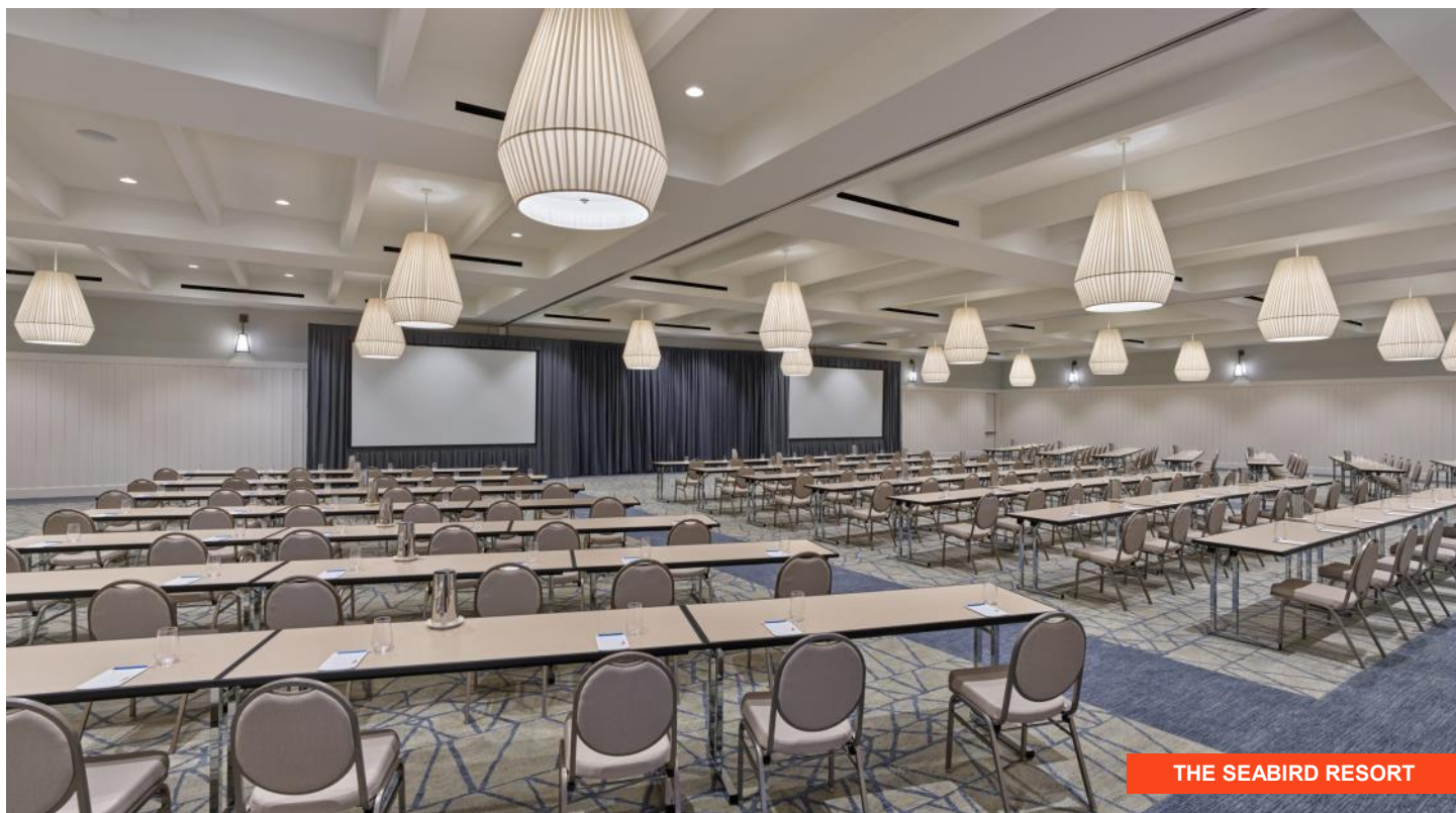
THE SEABIRD RESORT

3302 Senior Center Drive (760) 435-5244 Capacity: 250 Outside Catering Permitted: Yes specialevents@oceansideca.org